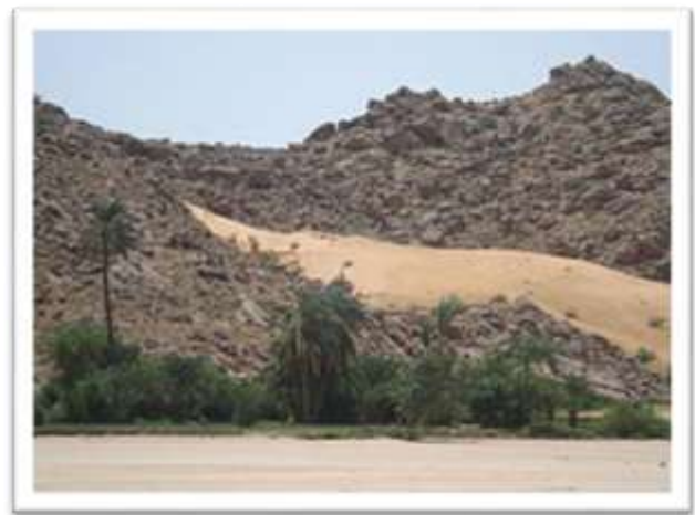
Fig. 1: The Picture of location of study area sand valley of kutum side mount

The study area is located in north Darfur state kutum area it lies 120 Kilometers (75 mil) north west of the state capital, Al-Fashir. The town is located along valley, at latitude 14^{\circ}14'N longitude 24^{\circ}39'39,30''E is the administrative town of north Darfur district [13].