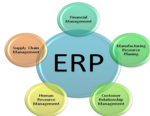
Fig. 1. Enterprise Resource Planing

Business process administration is a blend of data Technology systems and business process. Business process administration comprises of business standards, administration of procedure and data innovations. Cloud wonders apply on ERP and ERP called as cloud ERP. Cloud environment deals with the information on cloud for better get to [4] cloud has transformed into the way that people live now.