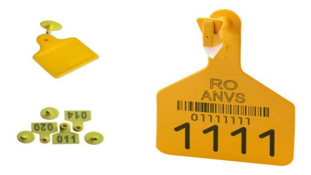
Fig. 3: RIFD Tags for Animals